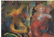
Photo Exhibition Museum of Natural History Vienna: 22.3.2007-7.5.2007 Ruanda mit den Augen der Kinder/Rwanda through the eyes of children

Photo Exhibition Museum of Natural History Vienna: 29.3.2006-2.7.2006: Die Kunst ist in der Natur/Art is in Nature